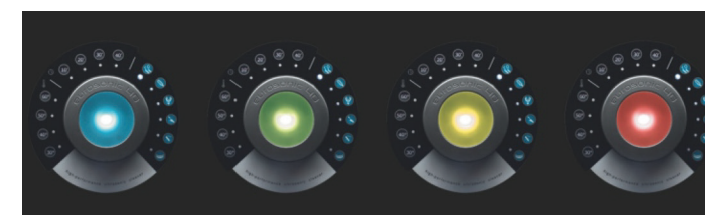
Backlit user interface with innovative light path