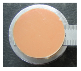
xantasil shrinkage behaviour after several weeks.