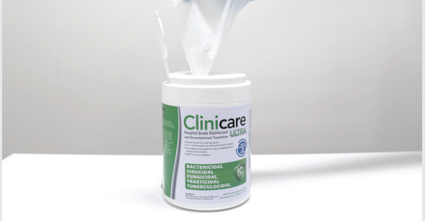
A. Dispense another Clinicare towelette